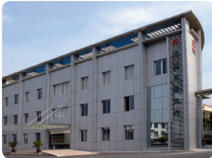
State-of-the-art manufacturing facilities.

That way we know we will be able to deliver the highest quality products to the medical profession both today and way into the future.