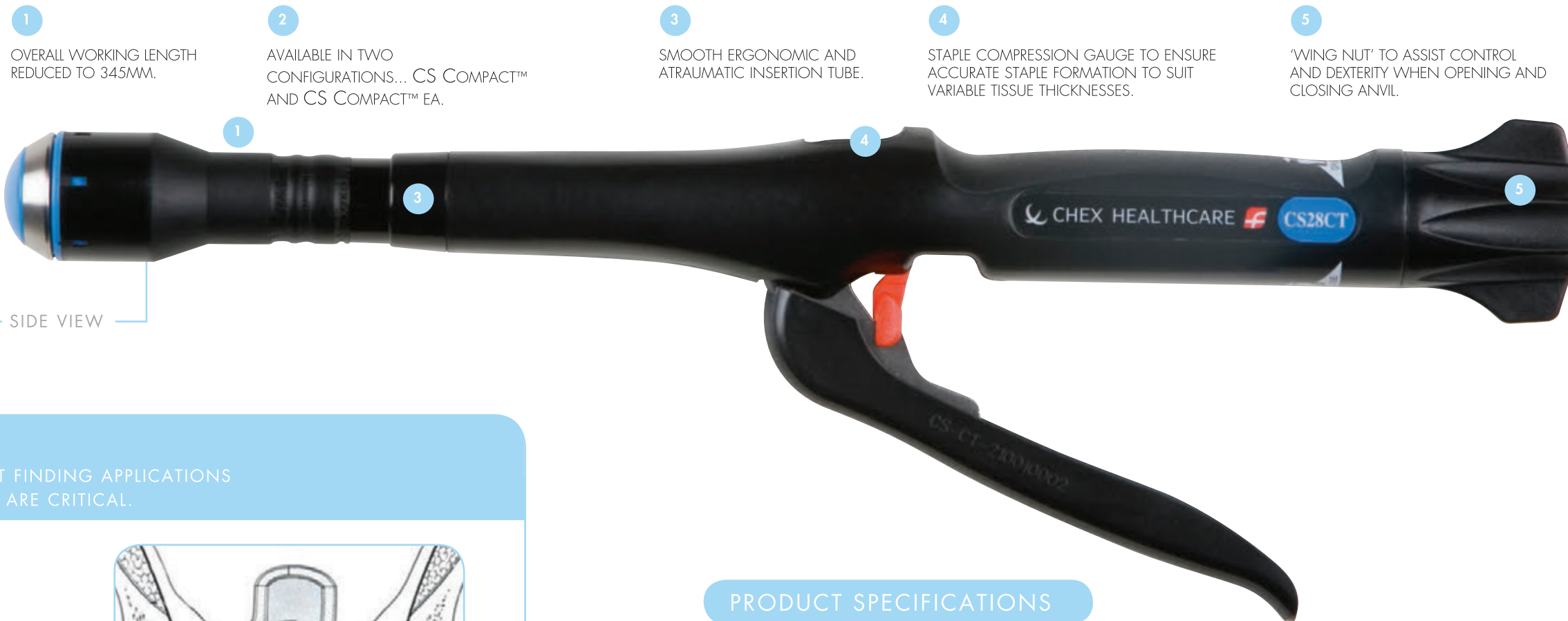
THE CHEX™ CS COMPACT™ CIRCULAR STAPLER ACTUAL SIZE